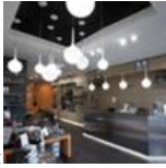
Watt Showroom Bialetti