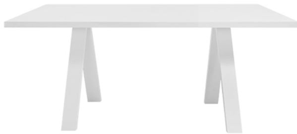
Table with rectangular top in white lacquered steel and aluminum and white lacquered steel legs. The legs can be mounted at 45 cm (17 3/4") from the top or flush with it.

ART. 5006: rectangular top 200 X 100 cm / 78 3/4" - 39 3/8"