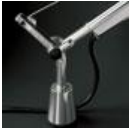
TOLOMEO SUPP.TAVOLO FISSO A004200