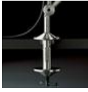
TOLOMEO MORSETTO A004100